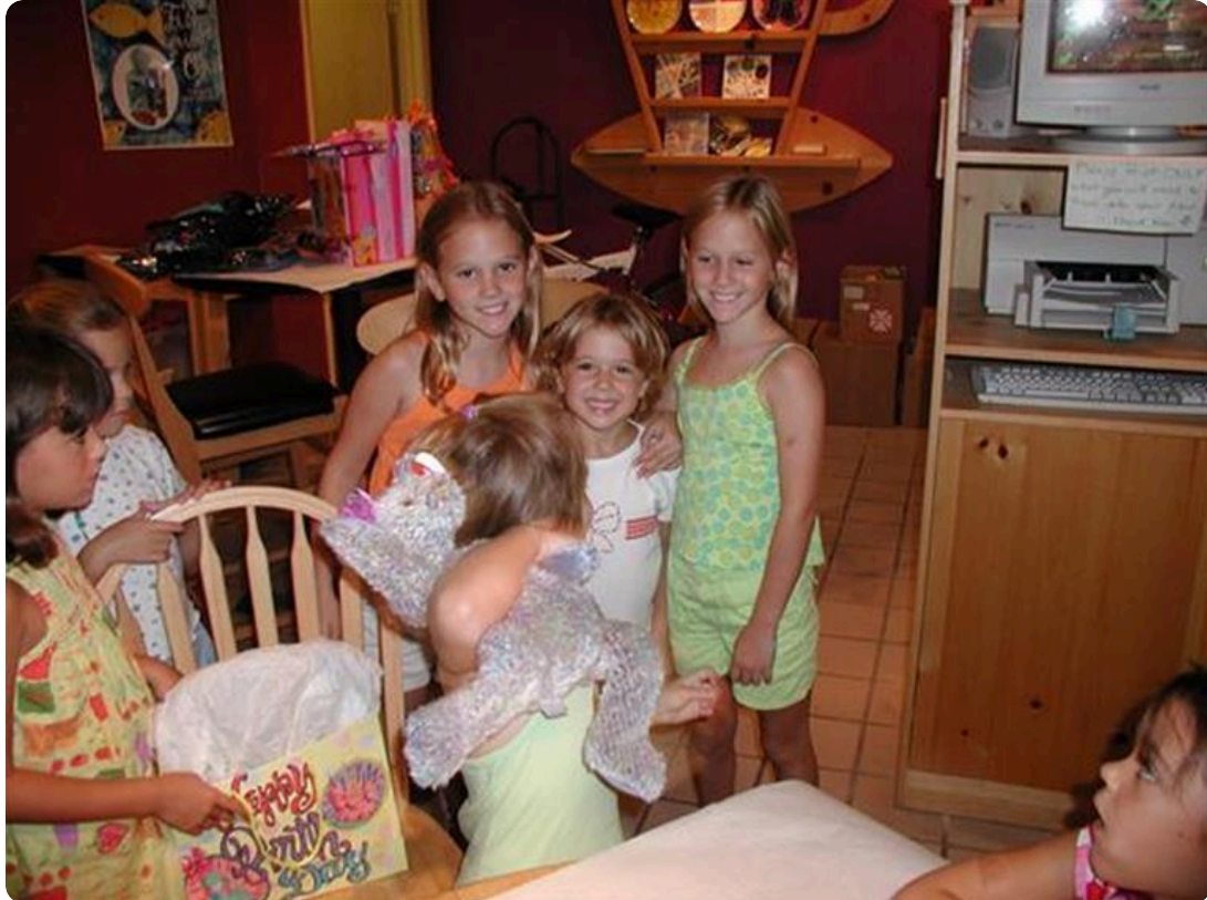
Sharing Birthday fun.